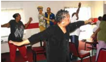
Residents of Delta Towers Apartments on H Street NE take a stretch and gentle movement class every Friday morning.