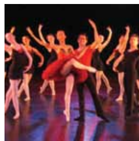
Classical Repertory Dance Theatre keeps our adult ballet students en pointe through more intensive training and performing opportunities