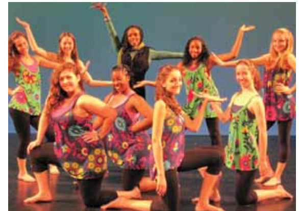
True to its name, DanceFusion Jazz Project merges its jazz stylings with other dance forms, including Bollywood