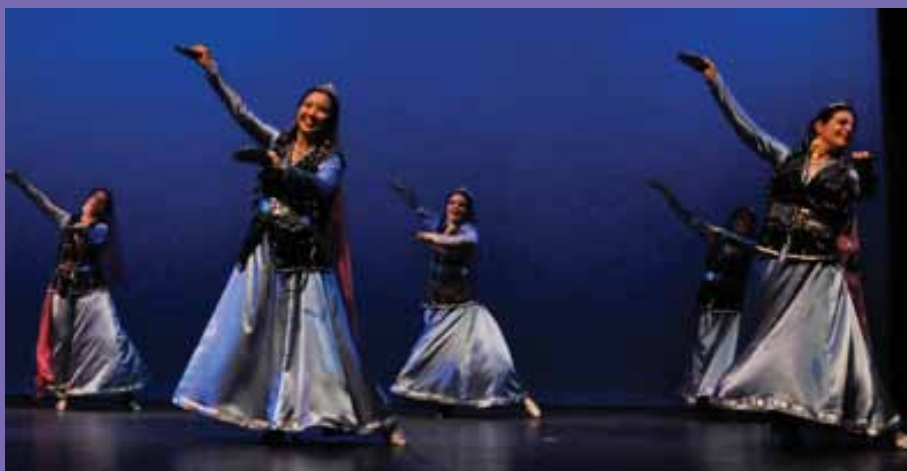
Nomad Dancers, our newest Resident Arts Partner, bring their dance stylings from India, Persia, Central Asia, Middle East, and Turkey to the stages of DC