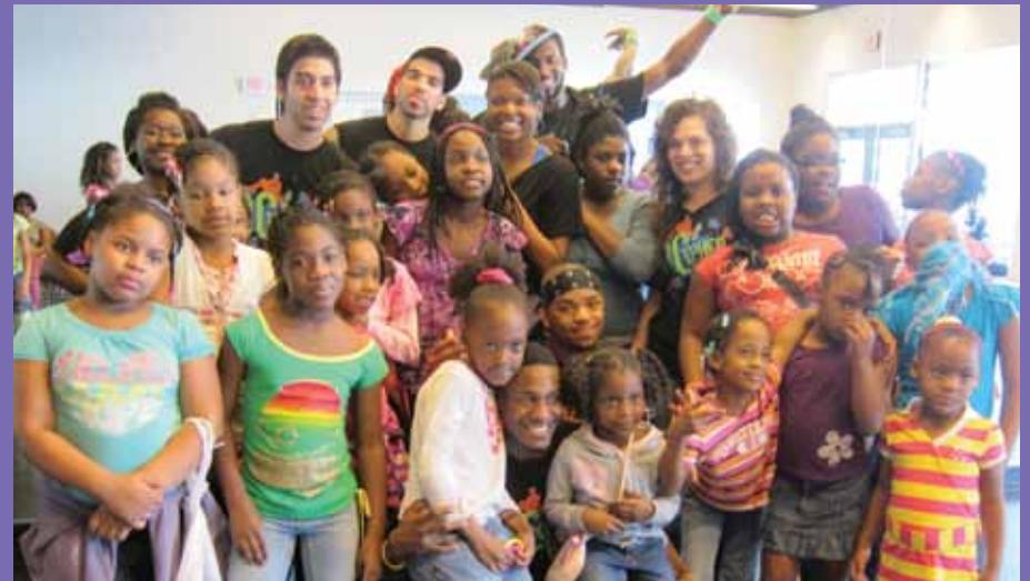
Horton's Kids spend a Saturday morning learning hip hop at the Atlas studio location for free through Motion Express.

We redesigned the format of our Motion Expressions outreach concerts to better engage the students at an age-appropriate level and to link with their academic curriculum. The fall show, "Dance Around the World," for grades 1-5 now offers students a sampler of dance styles from across the globe, including West African and Middle Eastern. The spring show, "The heART of Hip Hop," for grades 6-12 explores hip hop's history, principles, and elements, including a lesson from a live DJ.