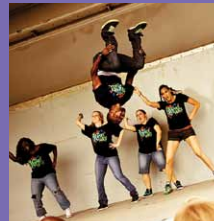
The audience flipped for DCypher Dance's performance to a Michael Jackson medley at National Dance Day

We launched an aggressive and ambitious social media strategy across Facebook, Twitter, YouTube, Flickr, and our blog, which has skyrocketed our online presence, with staff, interns, workstudy, faculty, and board members all chipping in.